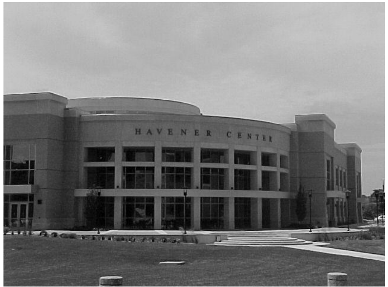
The new student union building, Havener Center, opened on the Missouri S&T campus in January 2005.

Intercollegiate athletics at Missouri S&T are conducted in a manner to protect and enhance the physical and educational welfare of student-athletes. Intercollegiate sports provide highly skilled athletes the opportunity to develop their abilities in an environment which promotes scholarship, leadership, sportsmanship and loyalty to the institution. A student-athlete's behavior shall at all times reflect the high standards of honor and dignity that characterize participation in competitive sports in the collegiate setting. The S&T athletics program shall be maintained as a vital component of the educational program, with the student-athletes being an integral part of the student body. The admission, academic setting and academic progress of student-athletes shall be consistent with policies and standards adopted by the institution for the student body in general.